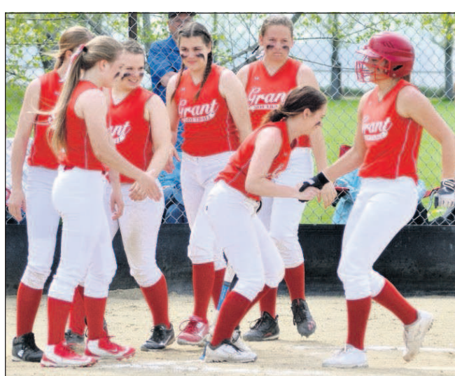
The Eagle/Angel Carpenter

Vale is at the top of the league, followed by Grant Union second, and Enterprise