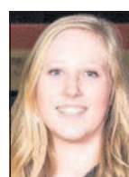
Cassie Hire Prairie City Lady Panthers Second Team