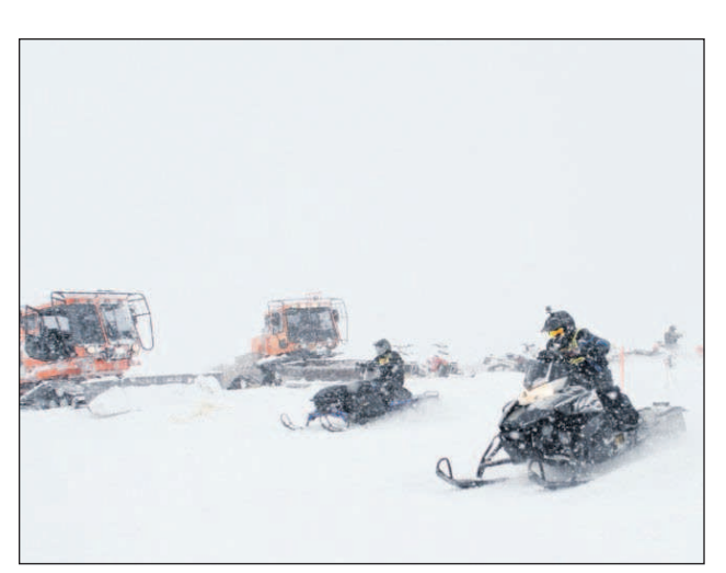
One snowmobiler beats another to the finish line during a drag race as part of the Seneca Winter Classic Saturday, Jan. 7.