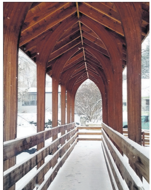
The Eagle/Angel Carpenter