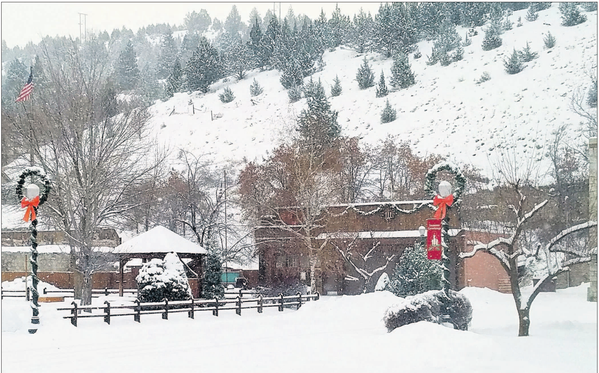
The Eagle/Angel Carpenter