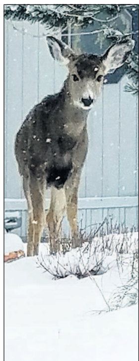
A young deer roams a Canyon City neighborhood. TOP PHOTO: The winter scene in downtown John Day after recent snowfall.

Snow, ice create gorgeous scenery, but affect drivers across state