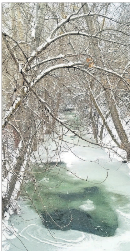
An ice-covered Canyon Creek provided a beautiful winter scene on Saturday from the covered footbridge in Canyon City.