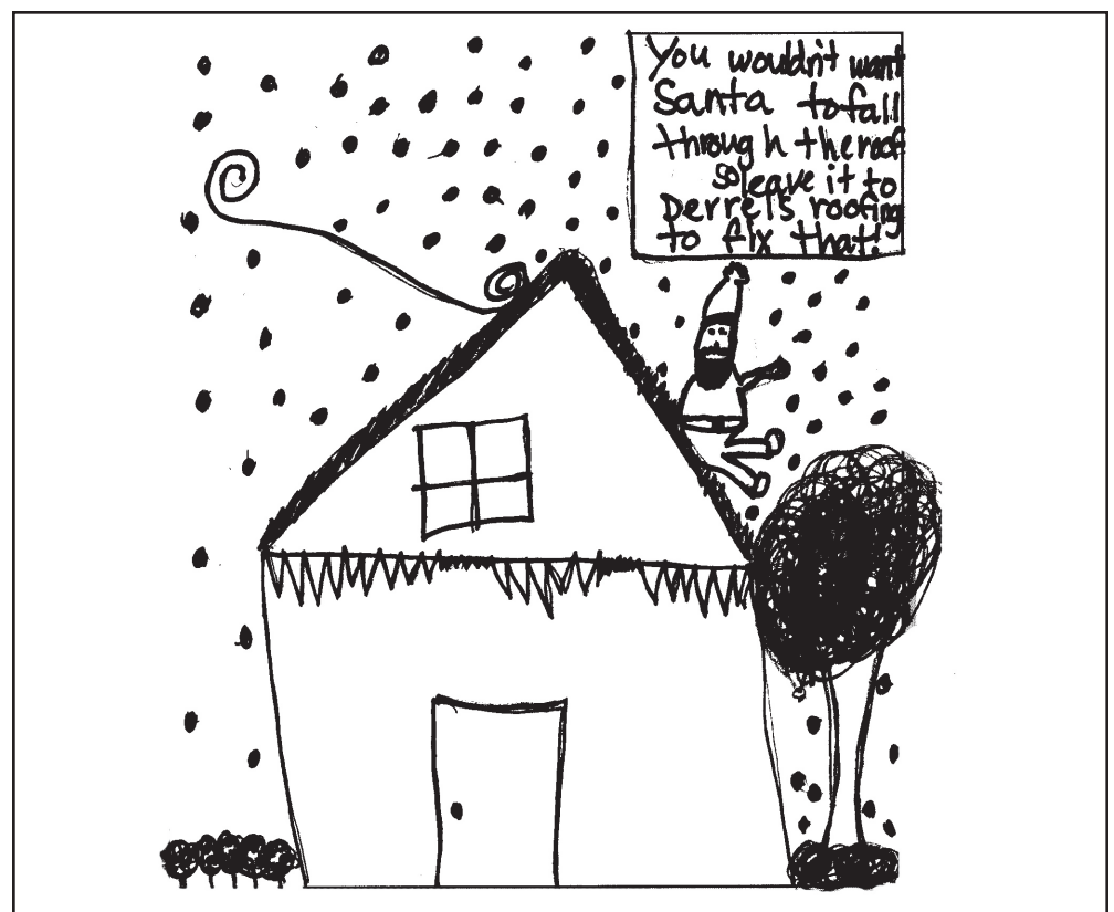
Lexi McKrola • 5th Grade, Humbolt

PIONEER FEED & FARM SUPPLY 831 West Hwy. 26 • 541-575-0023