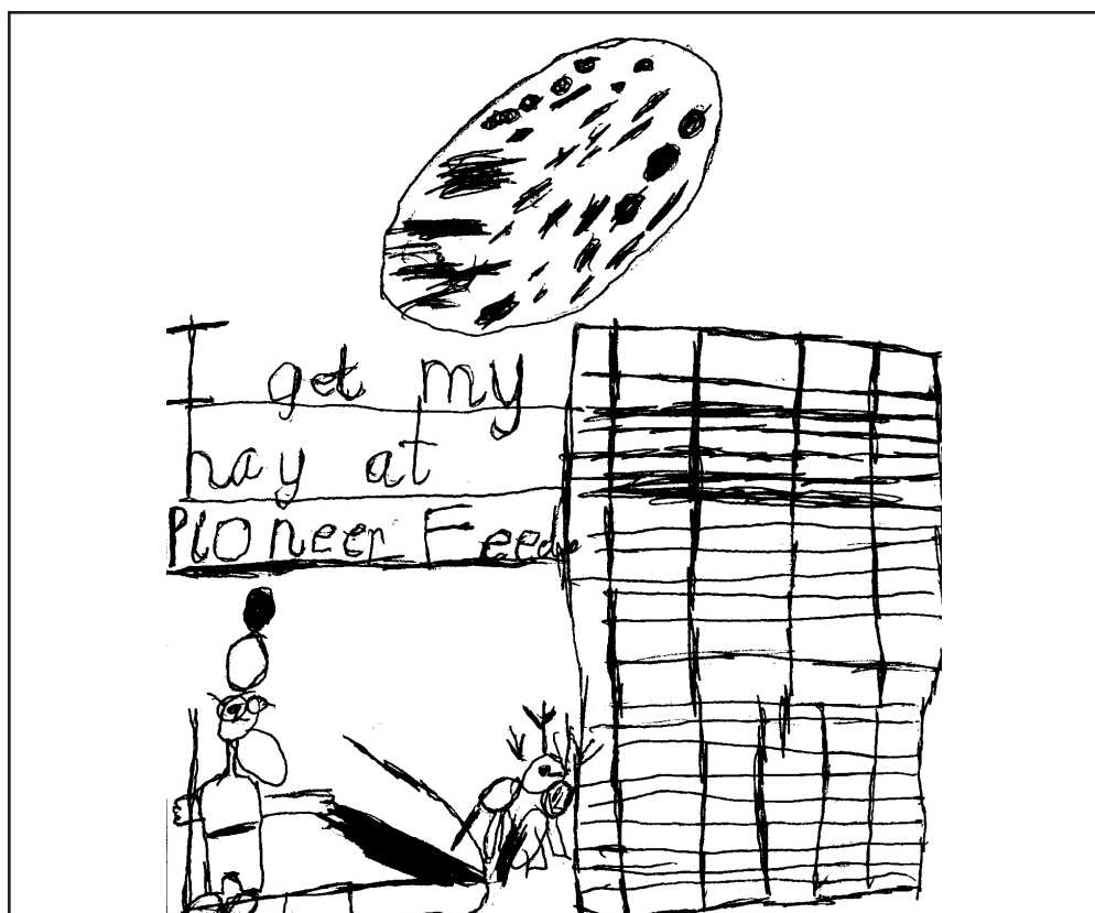
Jerett Waddel • 2nd Grade, Humbolt

PIONEER FEED & FARM SUPPLY 831 West Hwy. 26 • 541-575-0023