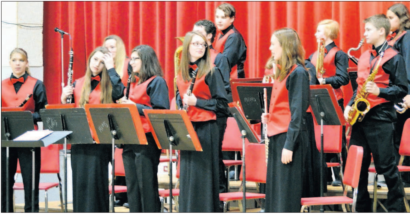
The Grant Union senior band stands to take a bow during their Oct. 25 fall concert.