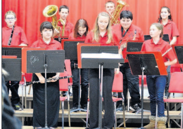
The Grant Union junior high band bows at the end of their presentation.