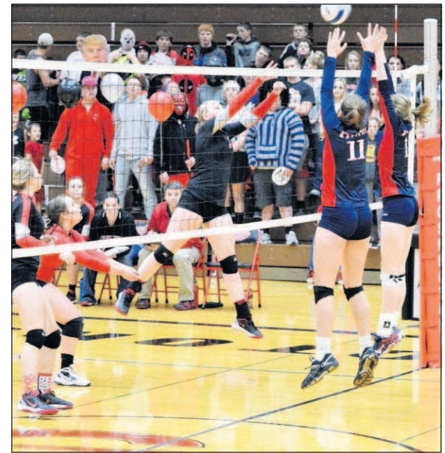
The Eagle/Angel Carpenter