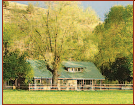
SOUTH FORK RANCH! River frontage, 205 ac, 50 irr, 2

Lori Hickerson 541-575-2617 ljh@ortelco.net • Sally Knowles 541-932-4493 sknowles@ortelco.net • Babette Larson 541-987-2363 ddwr@ortelco.net