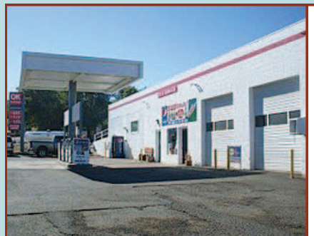
OK GARAGE! Mini mart, fuel &

mechanic shop, liquor, tires. $225,000 OWC RMLS #16498307