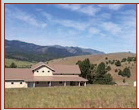
560 AC OFF GRID BEAUTY & SECLUSION! 2/2, barn, shop,