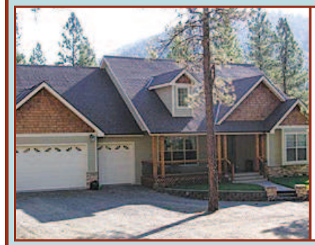
CUSTOM BUILT HOME!

7 Ac, timber, views, 3/2, deck, landscaped, garage. $385,000 RMLS #13636047