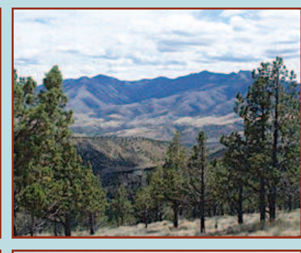
242 ACRES UP SHOP GULCH!

Borders public ground, cabin, springs. $818,000 RMLS #16586761