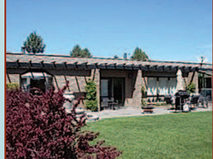
8.84 ACRES w/ EARTH BERMED HOME!

mechanic shop, liquor, tires. $225,000 OWC RMLS #16498307