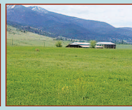
166 ACRE HAY RANCH!

story, 3/2.5, shop, corrals. $679,000 RMLS #16466846