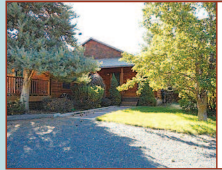
CEDAR SIDED HOME ON 7 ACRES!

Views, 3/2, carport. garage, large shop. $499,000 RMLS #16295287