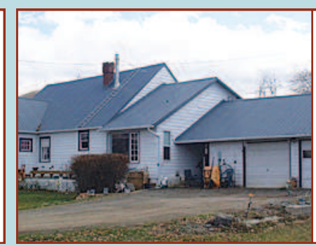
2 STORY FAMILY HOME ON 2.96 ACRES! Mt views, 4/2,

160 Irri, 3 pivots, 2 hay sheds, shop, barn, 2003 MF home. $950,000 RMLS #16373459