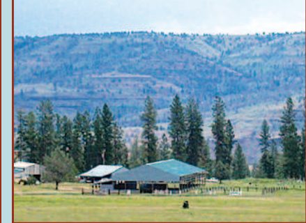
PRIVATE 320 ACRES!

15 Ac near Unity, irri, MF home, corrals, outbuildings. fenced. $215,000 RMLS #16136314