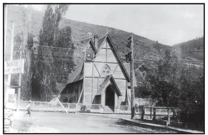
St. Thomas Episcopal Church, Canyon City, 1905.