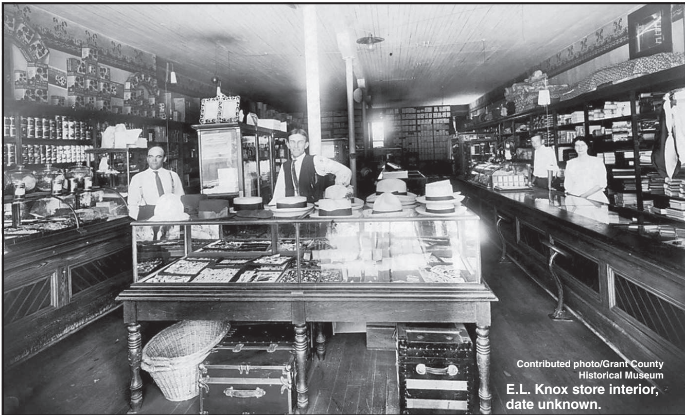
E.L. Knox store interior, date unknown.