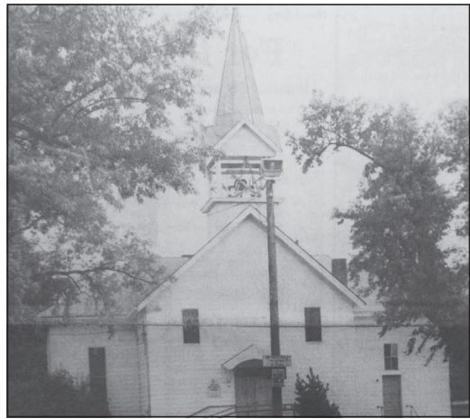
From Aug. 1, 1985: Prairie City's United Methodist Church is one hundred years old. In honor of the centennial there was a special celebration. The church building is now the Prairie City Community Center.