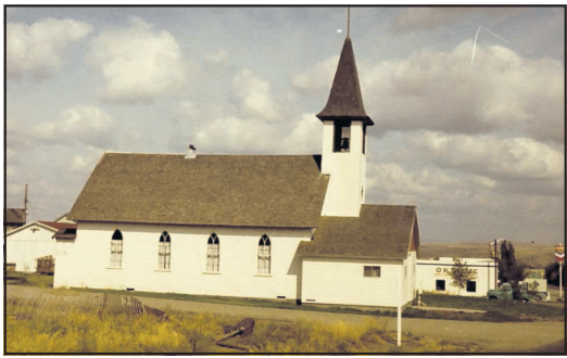
Long Creek church, circa 1972.