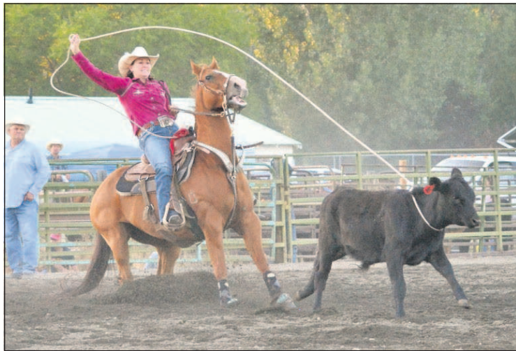
The Eagle/Angel Carpenter

Other local competitors at the Grant County NPRA Rodeo included: