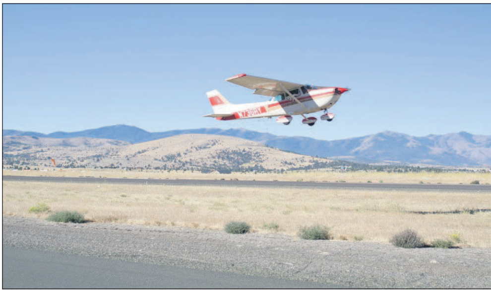
The Eagle/Rylan Boggs

During the Fly-In, students in grades one through 12 were given free airplane rides around Grant County Regional Airport. Six pilots volunteered their time and