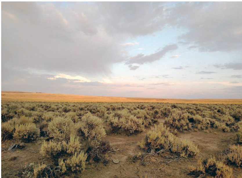
Scenic photo of Juniper Unit south of Burns.