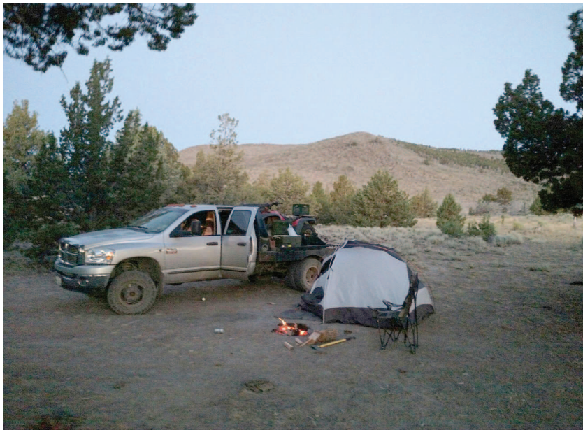
Armstrong's camp was set up 5 miles from where he killed the antelope.