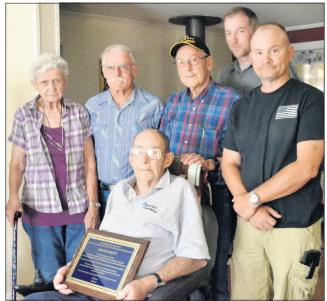
The Eagle/Angel Carpenter

"The community can be really proud of the efforts that everyone has done — all you guys can be proud of all that you have done."