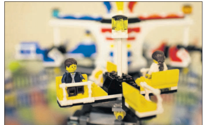
A nauseous Lego man sits on a ride belonging to the Grant County Library Tuesday, Aug. 9. The library holds Lego night every first Monday of the month at 6:00 pm.