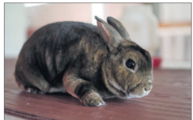
A Rex Rabbit waits on a table in the small animals barn Tuesday, Aug. 9. During the fair the rabbits are judged on characteristics like eye color, weight and coat quality.

and classics, along with southern rock and blues.