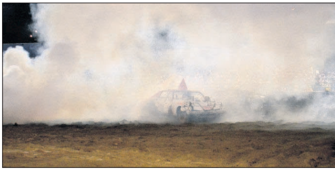
Derby cars emerge from the smoke during the Main Event.