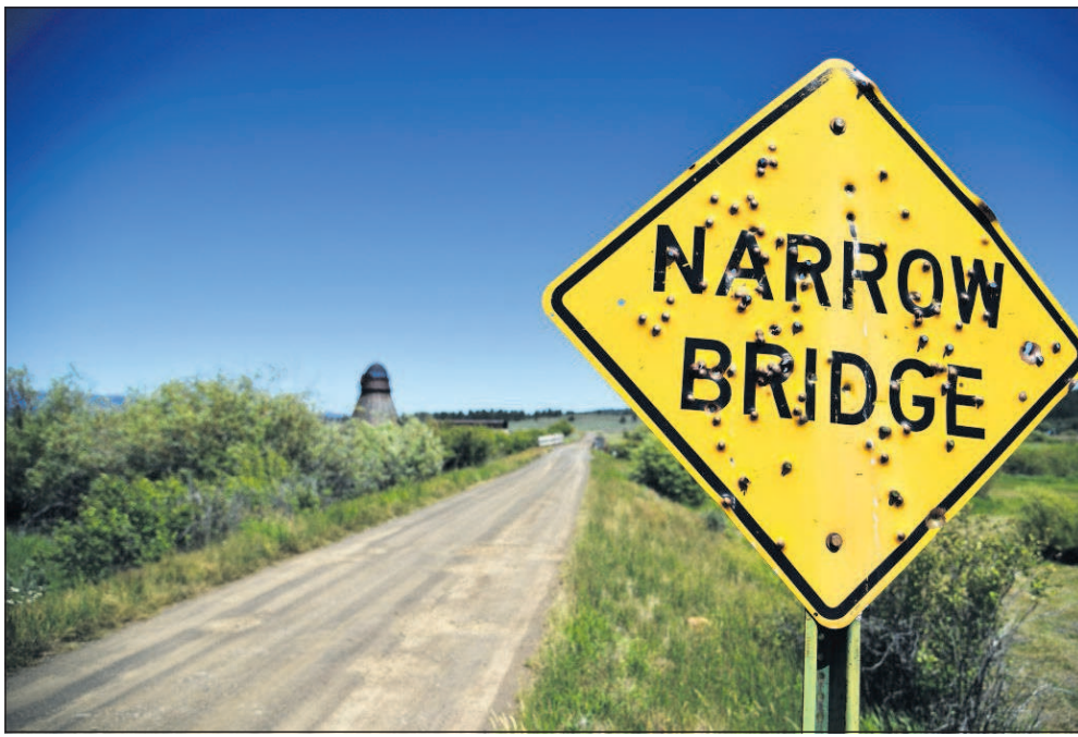
Mile 209.4 - A bullet-riddled road sign in Seneca on Highway 395.

It is not easy on the soul. The one constant through all