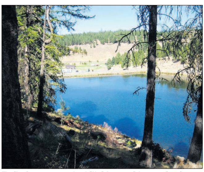
Trails from up on the hillside provide scenic views of Bates Pond and the state park beyond.

How to get there: From Prairie City, head east on Highway 26 about 15 miles. Turn left on State Route 7, and left again just past mile post 1 onto County Road 20/Middle Fork Lane. The entrance to the park is about a 1/2 mile ahead on the left.