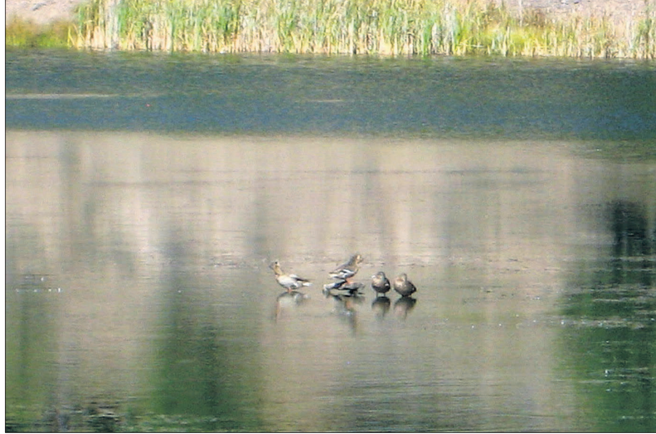
Eagle photos/Cheryl Hoefler

The park, which opened in 2011, is one of the newest in the Oregon State Park system. Its very existence