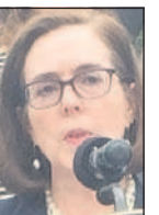
Gov. Kate Brown

The plan, "Oregonians United to End Gun Violence," involves state legislation to close loopholes on existing gun control measures and executive orders to keep better records on gun transactions and gun-related deaths.