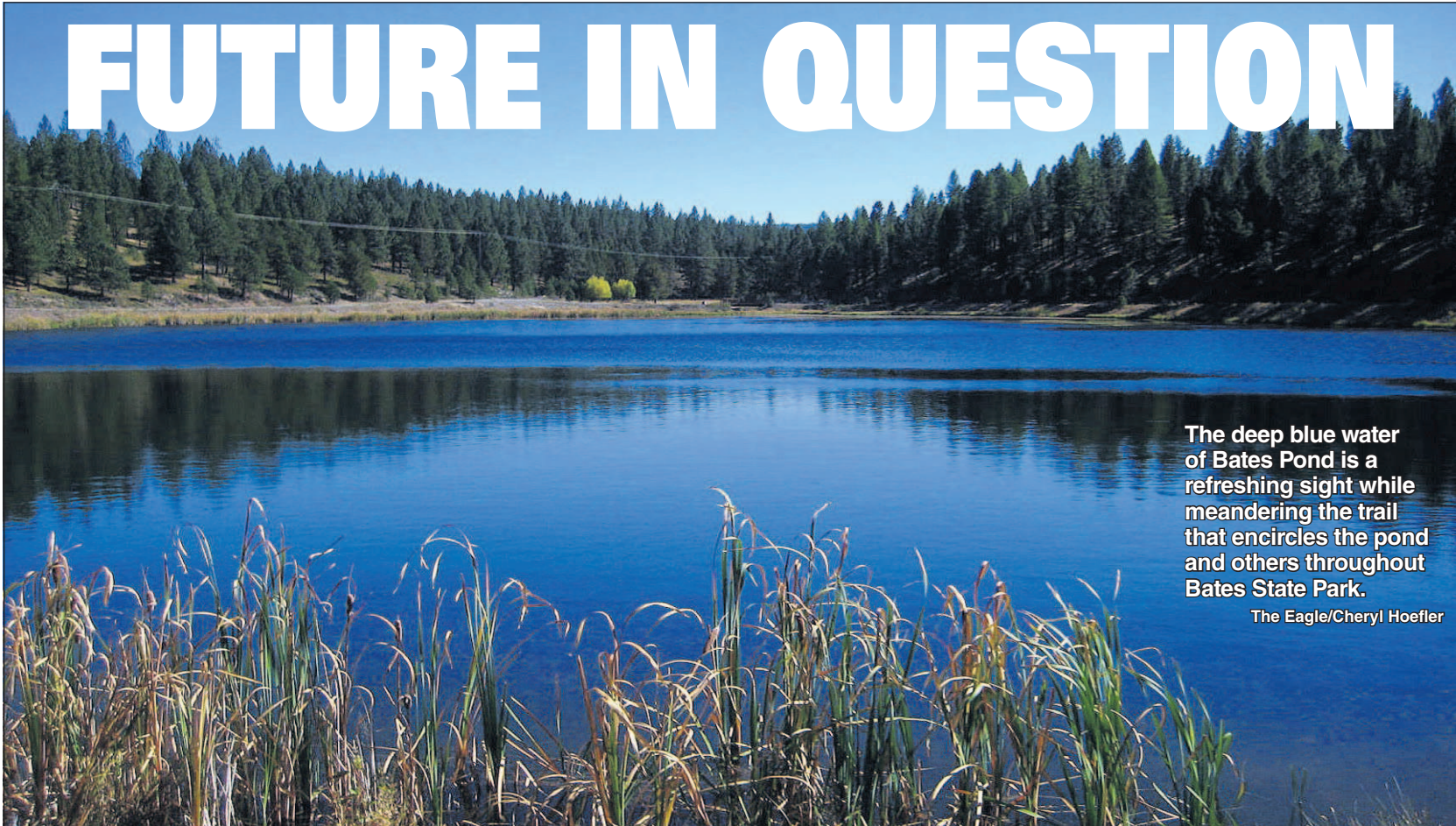
The deep blue water of Bates Pond is a refreshing sight while meandering the trail that encircles the pond and others throughout Bates State Park.