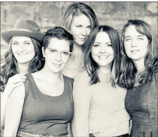
The all-female combo Della Mae will perform June 19 at the Diamond Hitch Mule Ranch near Kimberly.

Call Families First Parent Resource Center at 541-575-1006 or visit Families First on Facebook.