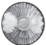
Meat & Cheese

We have GIANT SUBS by the foot and FESTIVE PARTY PLATTERS that are sure to get the party started