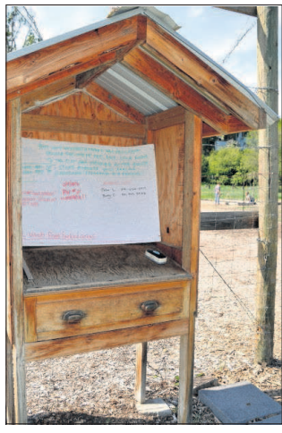
The message kiosk at the community garden helps relay information among gardeners.

Garden members will have a booth at the John Day Farmers Market "Spring Festival" on Saturday, June 18, with drawings for several prizes and gift baskets, many of which are donated by local businesses and individuals. This is the group's main fundraiser which helps purchase items needed to expand and improve the garden.