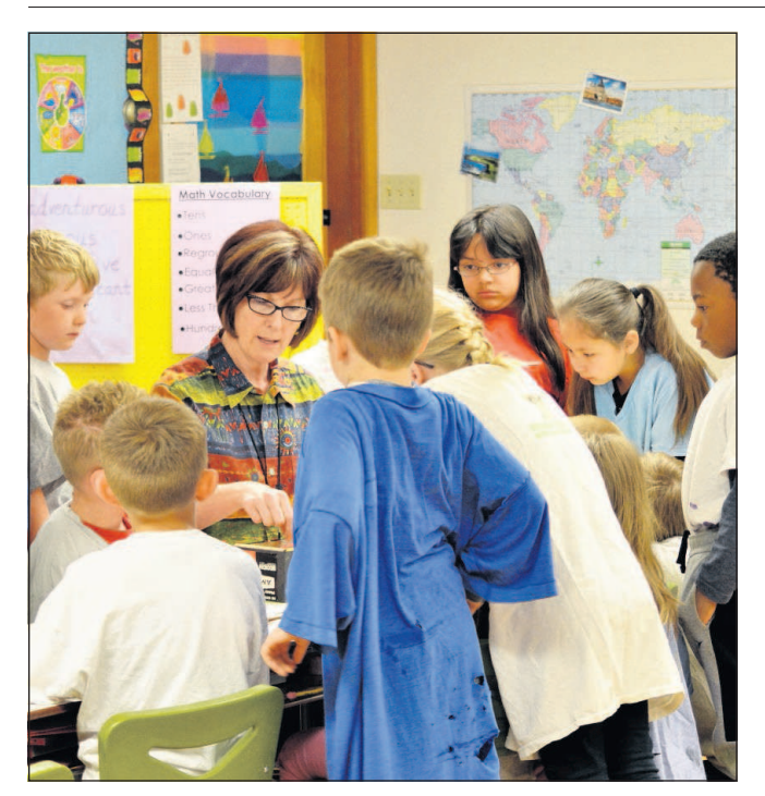
The Eagle/Angel Carpenter