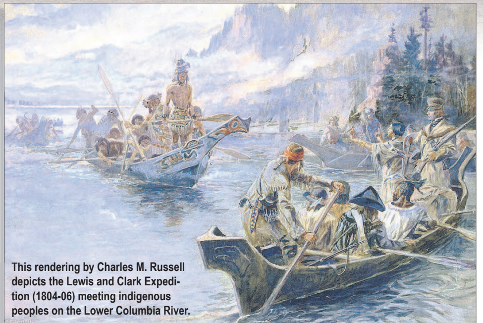
This rendering by Charles M. Russell depicts the Lewis and Clark Expedition (1804-06) meeting indigenous peoples on the Lower Columbia River.

1824 Office of Indian Affairs is established within the Department of War.