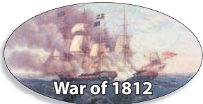
War of 1812

1819 Florida acquired through a treaty with Spain, adds more than 46 million acres to the public domain.