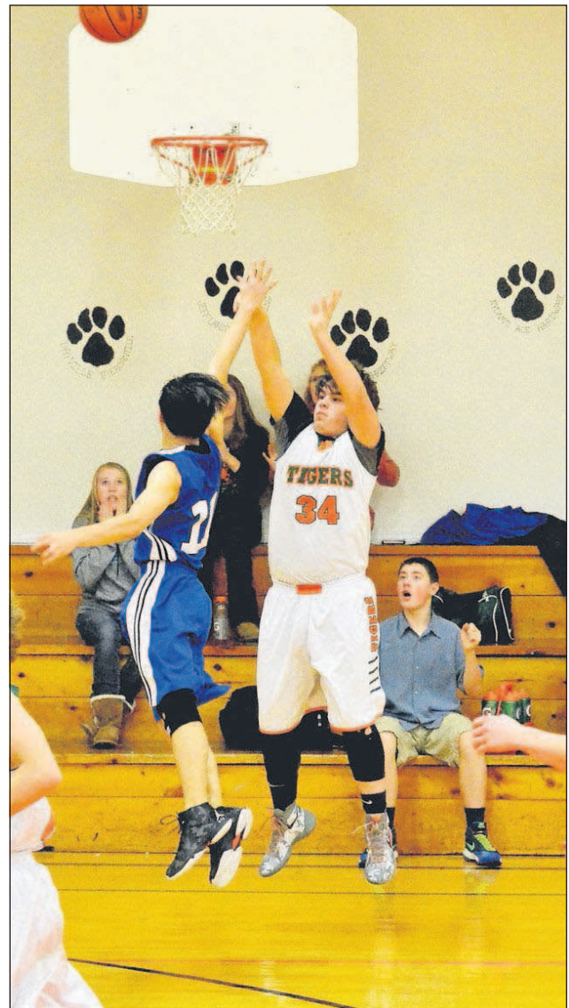
The Eagle/Angel Carpenter

Against Adrian the following day, the Tigers jumped out to a 15-point lead.