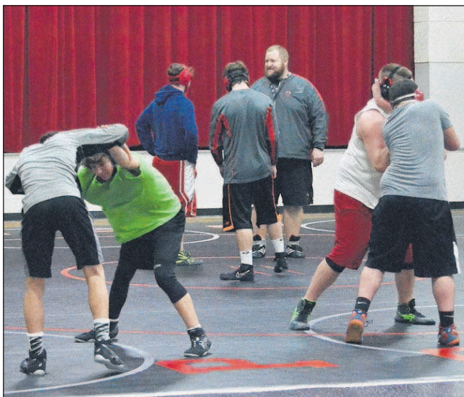
Grant Union wrestlers work out Monday, preparing for their home tournament scheduled for noon Friday.