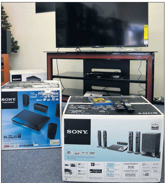
John Day Video Shoppe carries a complete selection of Sony entertainment systems and accessories.