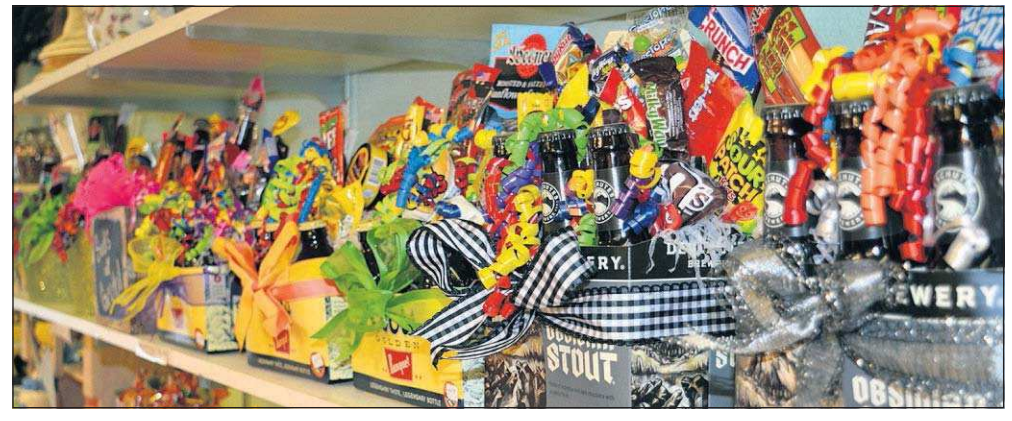
A six-pack of "Man Roses" from A Flower Shop N More might be the perfect gift for any guy on your shopping list.

Just like the name implies, A Flower Shop N More in John Day has more to offer than fresh flower bouquets. Specialty chocolates, can-