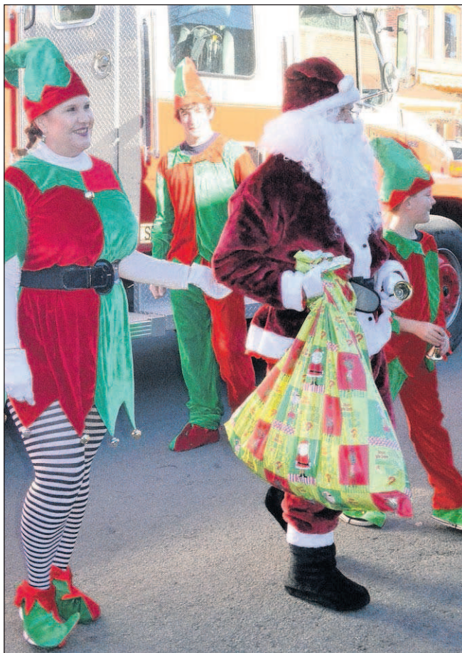
Santa Claus and three of his elves make their grand entrance at the Teen Center, thanks to a courtesy ride from the Prairie City Fire Department.