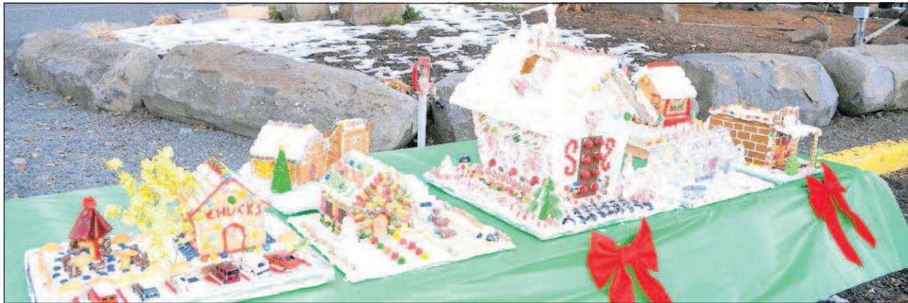
A wide variety of gingerbread houses from Prairie City businesses wait to be auctioned off during Christmas on the Prairie. Proceeds benefited Talents and Treasures, organizers of the event.