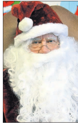
Ducks, 43-16 Santa Claus North Pole