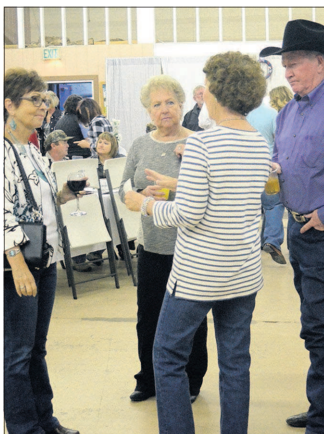
Attendees mingle and chat before the dinner and presentation.

"They deserve recognition for their tremendous efforts over the years for the hospital and foundation," he said.