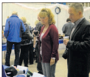
People look over silent auction items before the dinner.