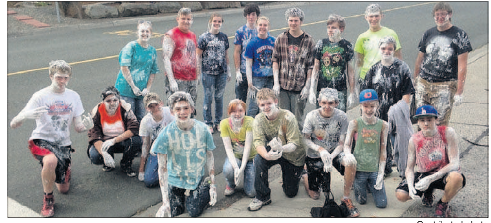
Members of Prairie City High School's freshmen and senior classes return from painting the 'PC' hill - and themselves - on Oct. 1.