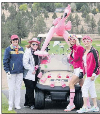
The Eagle/Angel Carpenter

BREAKING NEWS ALERTS myeaglenews.com/breakingnews