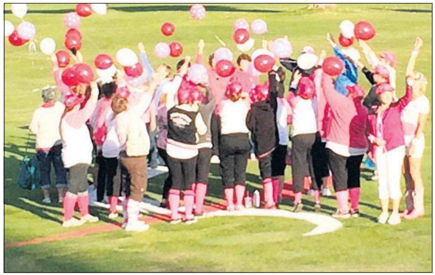
Contributed photo Ladies at the Rally for the Cure prepare to release balloons with special messages at the John Day Golf Club.