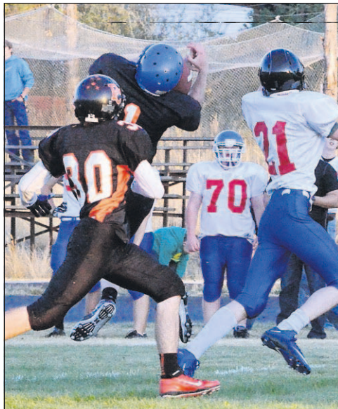
The Dayville/Monument Tigers host the Prairie City/Burnt River Panther/Bulls at 1 p.m. Friday at the Dayville field for what will be the league opener for both teams.