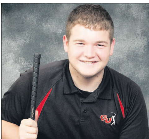
Nathan Gehley