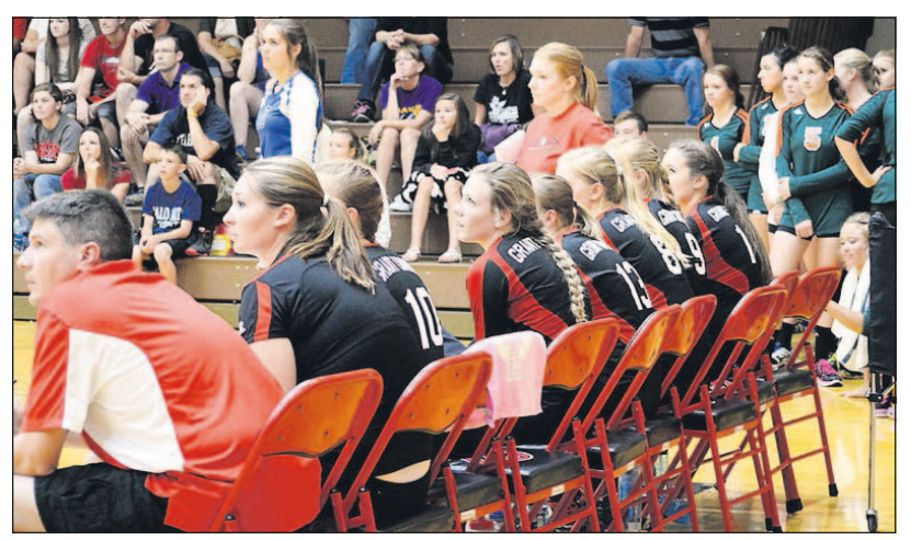
The Grant Union Prospectors watch the final moments of a game while the Dayville/Monument Tigers prepare to take the court.