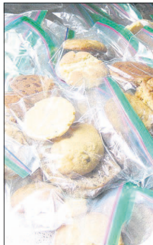
Thanks to a team of local bakers, baggies of homemade cookies are ready to be transported with dinners for spike camp crews on Aug. 28.