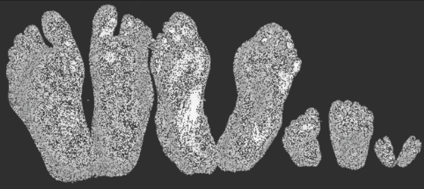
The doctor speaks Spanish - El Doctor habla Espanol.

2830 10th St., Baker City, OR | 541-524-0122 OFFICE HOURS: EVERY OTHER TUESDAY