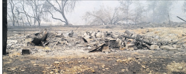
The shop of Amy Hoppe's late grandfather, Buck Hoppe, was destroyed in the fire.

According to the North Lincoln fire crew, Amy said, the forestry department crew