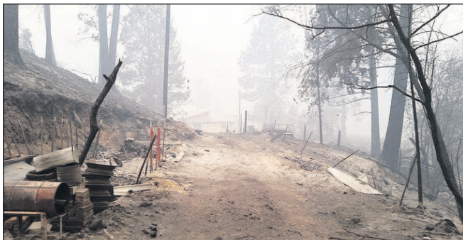
Dortha Hoppe's house, just beyond the driveway, is mostly intact, while everything surrounding it burned.

couple of windows were blown out and vinyl siding melted in places, Hoppe said, but otherwise, it was intact.