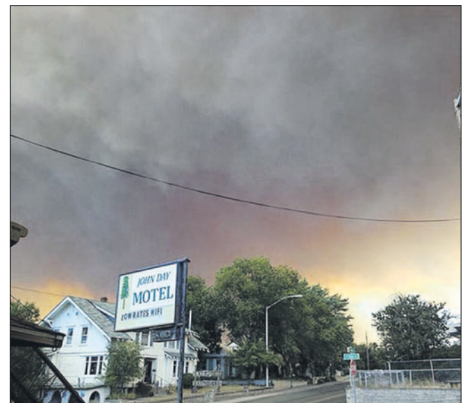
facing northeast out of John Day on Friday afternoon, Aug. 14.