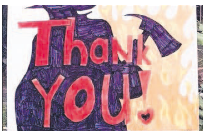
Stacey Schuetze created and posted this sign to express her gratitude to all the firefighters.

About 575 firefighters are working the fire, which is currently over 43,000 acres in size and 0 percent contained.