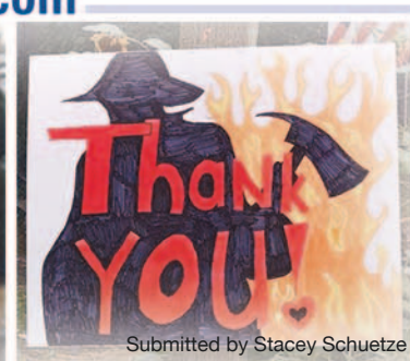
Submitted by Stacey Schuetze

To place your ad visit www.MyEagleNews.com or call 541-575-0710