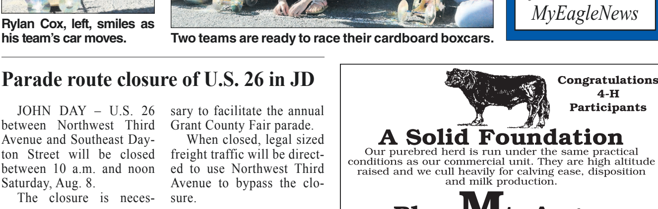
Our purebred herd is run under the same practical conditions as our commercial unit. They are high altitude raised and we cull heavily for calving ease, disposition

Blue Mt. Angus Steven & Carolyn Mullin 64444 Indian Creek Road Prairie City, OR 97869 (541) 820-3371