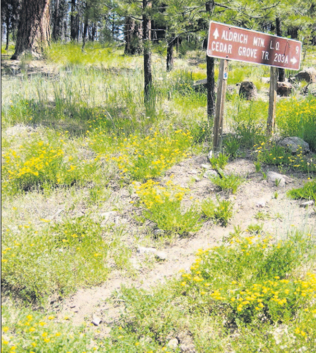
The trail, though well-defined later, has a tricky start from the gravel road, amid the brush and dirt paths trying to camouflage it. But it's there, right alongside the first sign which points the way.

difficulty level, Cedar Grove is easy to get to, and quite a spectacular local treasure, waiting to be discovered. Just remember to take plenty of water, snacks, a hiking stick or pole - and a camera for those wildflowers and yellow cedars.