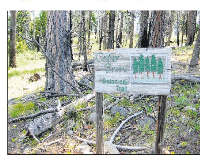
A few signs, including this one, point the way to the Cedar Grove Botanical Area Trail.