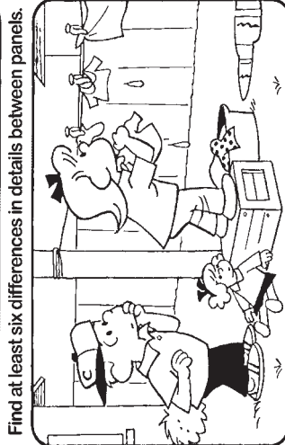
Find at least six differences in details between panels.