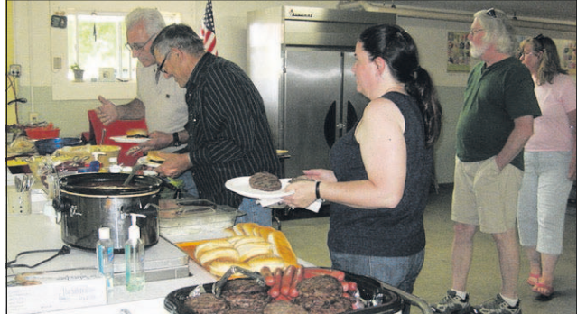
A crowd of about 40 from the Long Creek area, both citizens and firefighters from the nearby camp, enjoyed a bountiful potluck prior to the historical presentation.

About 40 people filled the Long Creek School cafeteria for the event – mostly citizens, plus several firefighters stationed at the Long Creek fire camp