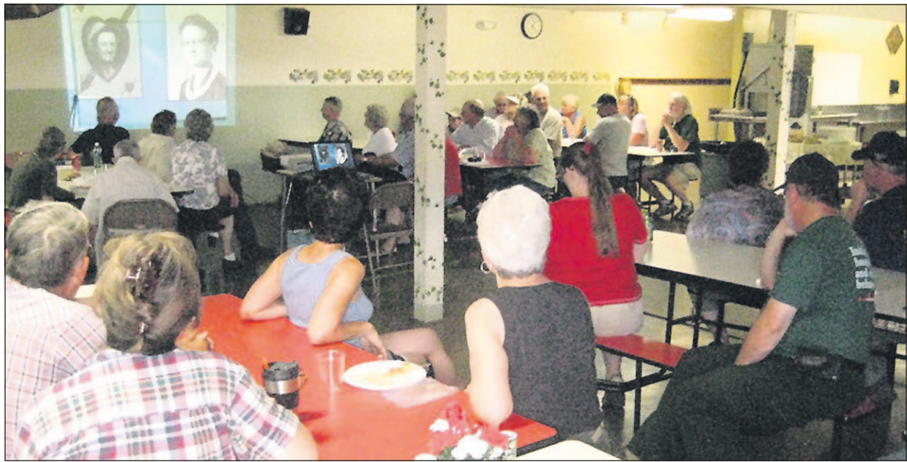
Long Creek citizens and local firefighters stationed at the nearby camp filled Long Creek School cafeteria for a potluck lunch and historical presentation on the Porter family during the 6th annual Founder's Day Celebration.