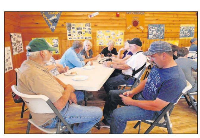
Mt. Vernon School alumni chat over breakfast at the Mt. Vernon Community Center on July 5 during the reunion weekend.

year after closing the school several years earlier. With no school building available now, the reunion committee is trying to raise money for a building in which they can house trophies and other school memorabilia.