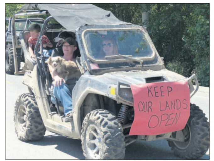
Dogs and kids join the fun, as the public access movement comes home to '62 Days.

A John Day Rural Fire Department truck bears the theme proudly. Story, parade results on Page A1.