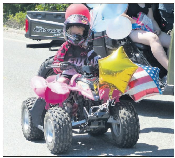
A little rider is ready for four-wheelin' in this year's '62 Days Parade.

Canyon Creek Mining makes a real haul in the annual parade.