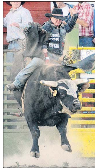
The Eagle/Angel Carpenter Challenge of Champions Bullriding Tour is returning to the Grant County Fairgrounds this weekend.