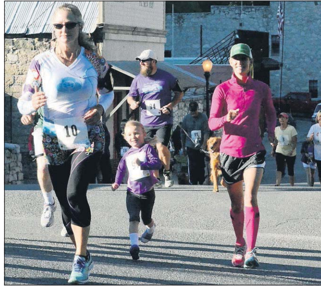
Runners get their start in the Gold Rush Run 5K, kicking off Saturday's '62 Days activities.